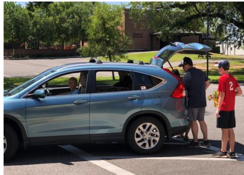
Volunteers picking up plants to deliver.