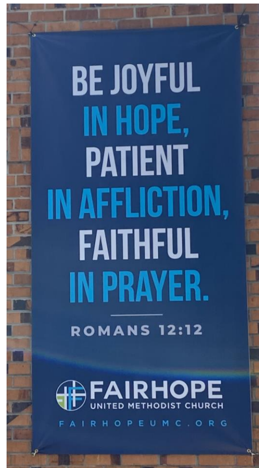
Prayer Ministry offers New Prayer Banner outside Wesley Hall

Prayer Ministry invites you to come to the church and experience a Meditated Prayer Walk around the Church Campus. There are 9 stations reflecting the Summer Sermon Series: The Unbelievable God . Members and friends are encouraged to come anytime between dawn and dusk to reflect on the scriptures and prayers located at each station. Come to the front doors of the sanctuary to see the map for the guided tour. Prepare your hearts for intentional prayer as you experience God's presence.