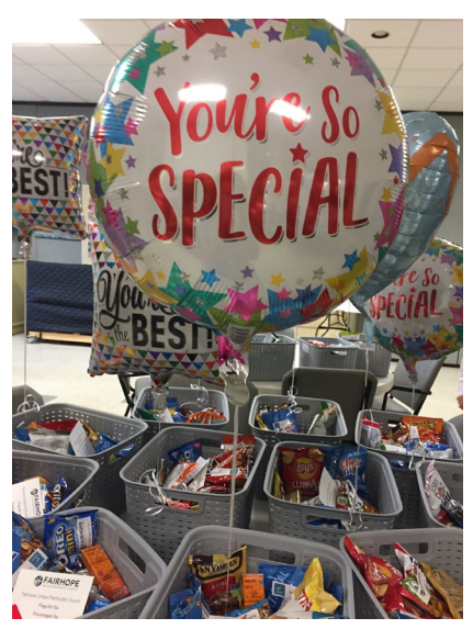
our healthcare workers.