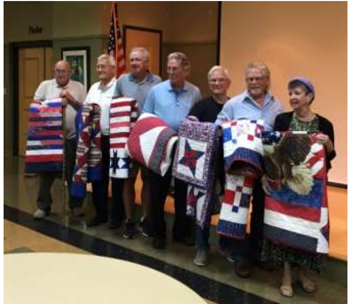
The June ceremony at Fairhope UMC.