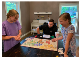
Have a family game night submitted by Dowden Family