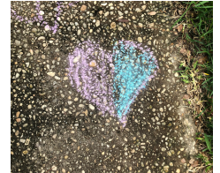
Chalk driveway with positive message/drawing submitted by Marass Family