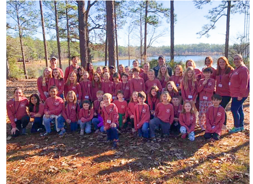
2020 Winter Retreat (Fairhope UMC had the MOST attendees!)